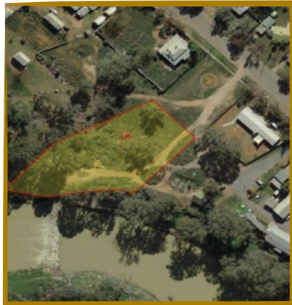
This is the block at the end of Bonney St, adjacent to the existing Wilcannia weir.