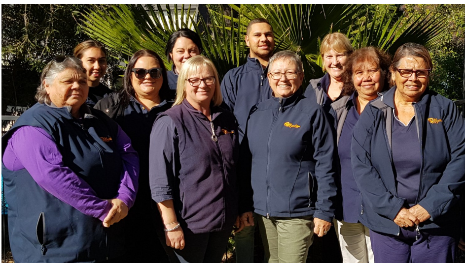
Marrabinya Staff, Face to Face Meeting 19 June 2019