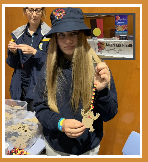
Decorated animal cardboard stencils to hang on school bags